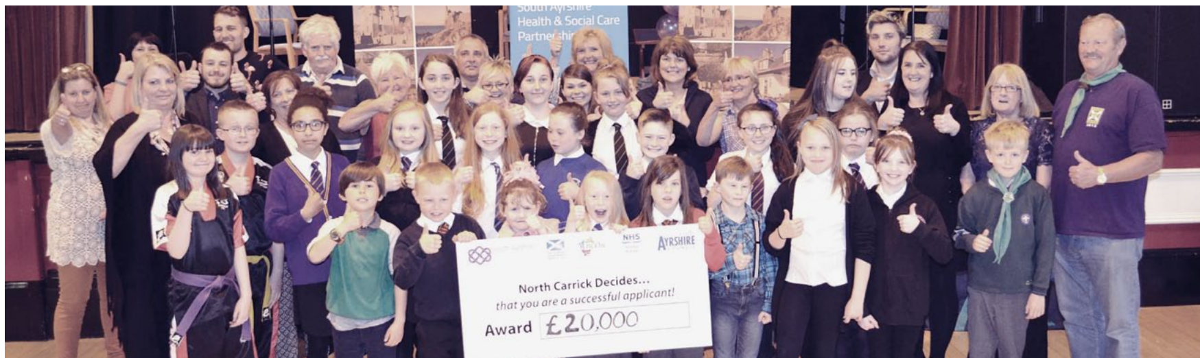
Above: Successful groups celebrate securing funding at North Carrick Decides Participatory Budgeting event