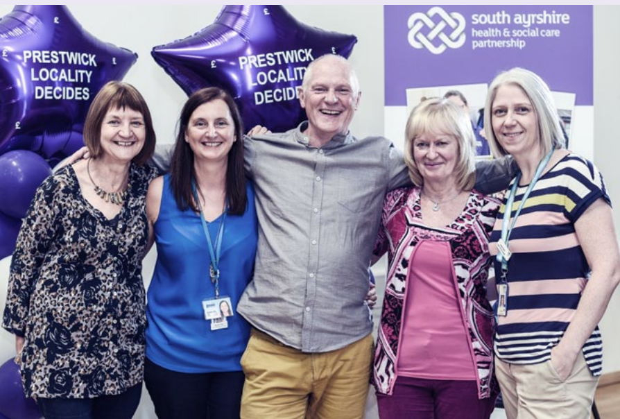
Below: Prestwick and Villages Locality Planning Group' members