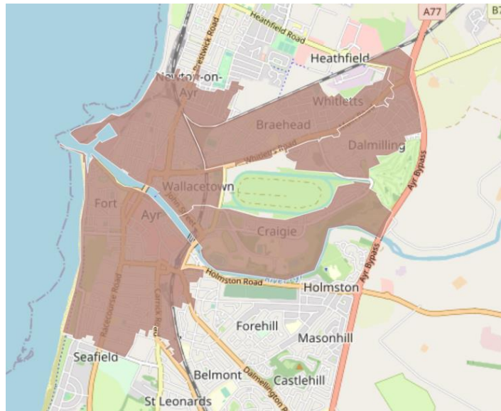
Proposed new Ayr North and Central area

This is described better with illustrations: